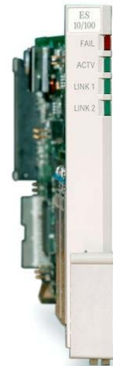
■ ■ ■ Ethernet Service ES10/100

By leveraging the Tellabs 1000 MSAP embedded base, you can cost-effectively increase capacity to your existing radio access networks. The Tellabs 1000 MSAP supports a wide variety of 2G traffic backhaul interfaces (e.g. DS1, IMA, xDSL and DS3) and Ethernet interfaces for the 3G (e.g. ES 10/100 and GbE222). Ethernet migration on the Tellabs 1000 MSAP is paramount since IP is the foundation for new multimedia services and transport.