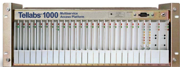
“Gold” Tellabs 1000 MSAP

Tellabs 1000 MSAP can help grow HSI subscribers, extend service area coverage and offer faster Internet service speeds. You can start delivering lucrative Ethernet business services while continuing to support TDM services. On top of that, you can leverage existing Tellabs 1000 MSAP infrastructure to satisfy exploding mobile demand and strengthen your IPTV business case by marketing and delivering video today. Ultimately you can feed the bandwidth hungry revenue generating applications with end-to-end optical networks.