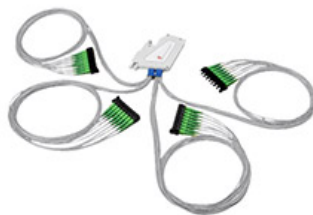
Fiber Splitter Blocks & Modules