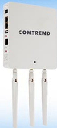
AC1750 Access Point

Higher Power | Higher Sensitivity 560mW | -93dBm | Connect & Go Installation