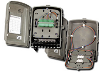
FET1 - up to 4 fiber terminations